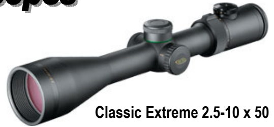
Classic Extreme 2.5-10 x 50

The Extreme series is true to Weaver's long heritage in riflescope design... built for hunters who need their scopes to perform flawlessly regardless of the time, the environment, or the conditions.