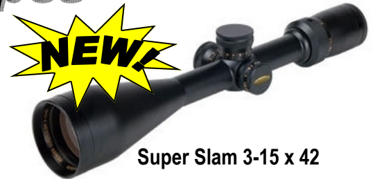
Super Slam 3-15 x 42

Welcome to the latest evolution of optics—the new Super Slam series from Weaver. Engineered to meet the strict standards of the legendary Weaver name, the new Super Slam scopes are loaded with all the latest technological advances of modern high-end optics. If you know and trust the Weaver name, you'll be impressed with this new line of premier riflescopes designed for the serious big game hunter and shooter!