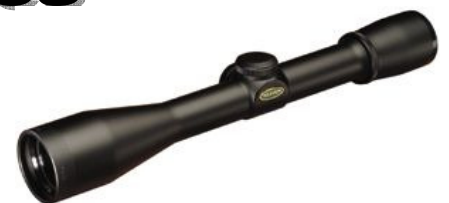
Classic K Scope 4 x 38

Our fixed K-Series scopes are monuments to durability and affordability. Fixed scopes have fewer moving parts, so they can take more punishment season after season. Fully multi-coated lenses improve image brightness and reduce glare. A one-piece, aircraft-grade aluminum tube holds the lenses in perfect alignment. They're waterproof, fogproof and shockproof — if you don't count the pleasant shock you'll get when you look at the price tag.