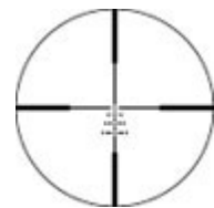
EBX RETICLE -The new reticle allows for accurate bullet trajectory compensation for long range shots Glass Etched Reticle for Ultimate Reliability!