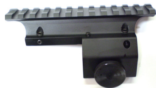
48332 MINI 14 TACTICAL BASE