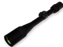
Grandslam 4.5-14 x 40

Grand Slam riflescopes compare to the best of the best at the sporting goods counter — except for our price tag. All Grand Slam scopes are equipped with the Micro-Trac 4 point adjustment system, the best in the industry. Fully multi-coated lenses reduce glare, increase image brightness and give you edge-to-edge clarity — they're outstanding in low-light situations. Grand Slam scopes also feature a fast-focus eyepiece adjustment ring to adjust the scope perfectly to your eye. The Weaver "sure grip" power ring helps you find and adjust the scopes' variables, even with heavy hunting gloves on. Finally, the Grand Slams' solid, one-piece construction makes them waterproof, fogproof, and shockproof, so they'll last for years to come.