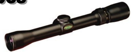
Classic Rimfire 2.5-7 x 28

Rimfire Scopes can make the most out of .22s and airguns. That's because we put big effort into scopes for smaller calibers. They're designed with the same rugged, sturdy one-piece aluminum housing that keep our larger scopes waterproof and fogproof, they have the same fully multi-coated, nonglare lenses, and with 28mm objective lenses they deliver excellent low-light brightness, just like every Weaver does.