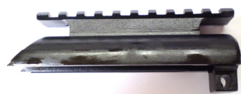
48331 SKS TACTICAL BASE